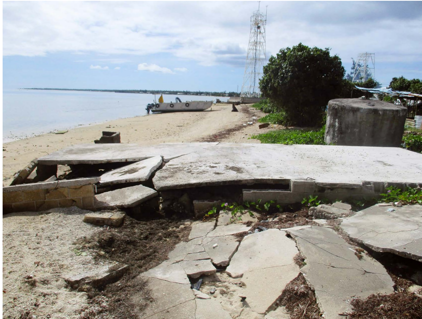
Maikolo Fonua Tonga 'This is Ha'apai Island, Kingdom of Tonga.'